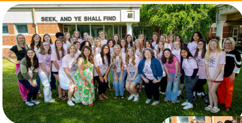
The GFWC LaFayette Juniors Club and their GFWC LaFayette Woman's Club and LaFayette High School sponsors.

Congratulations to the 2024-2025 Juniors Board and their LHS sponsors.