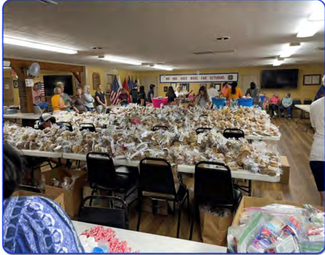
Members of the GFWC Lilburn Woman's Club assisted the VFW Post 9143 Auxiliary with another one of their Treats for the Troop packing events. The club prepared shipping labels for the boxes, some of which are headed for the local Georgia National Guard unit that is deployed.

Six members of the GFWC Brunswick Woman's Club joined the 53 8th graders and 10 staff/chaperones from Tallulah Falls School for a morning of service-learning at MAP International, a 70-year-old Christian organization that supplies needy areas of the world with medicines and basic supplies. Almost 2000 hygiene packs were assembled and packed by the club members, students, and staff, many of them going to the tornado-ridden areas of the Midwest.