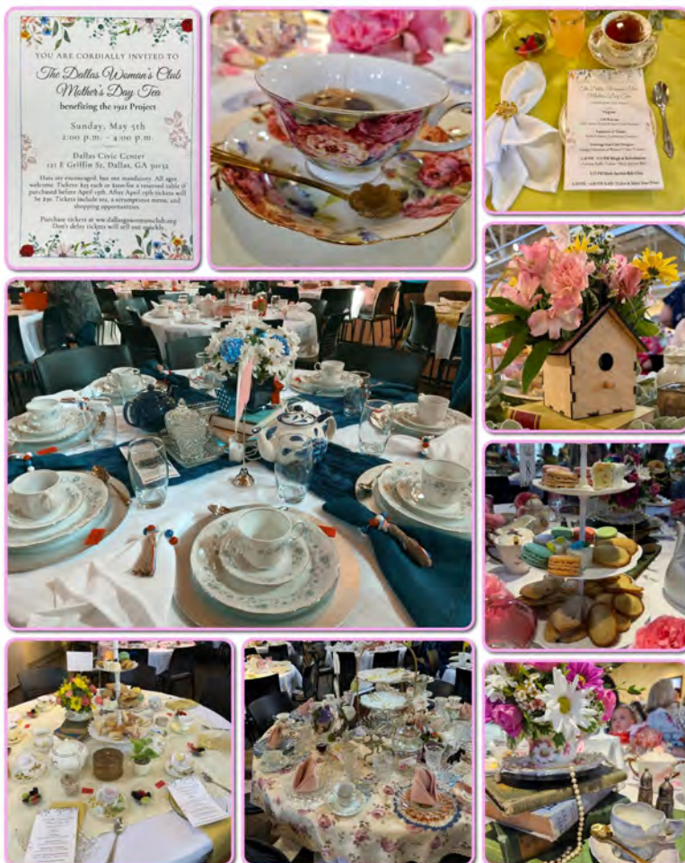
The GFWC Dallas Woman's Club held their Mother's Day Tea on Sunday, May 5, 2024. Proceeds from the event will benefit the 1921 Project to restore their clubhouse.