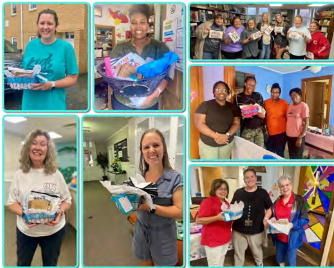
May 7th. Each basket contained notebooks, pens, and pencil pouches with inspirational sayings.

The Education CSP of the GFWC Hartwell Service League delivered "thanks for teaching" baskets to Hart County's private preschool teachers in honor of National Teacher Day on