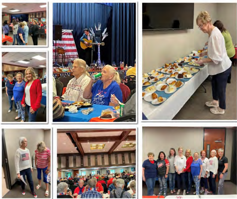
Members of the GFWC LaFayette Woman's Club assisted at the annual Senior Citizens Day in LaFayette on May 7, 2024. Seniors from Walker County were treated to a free meal and entertainment.