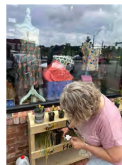
The Environment CSP of the GFWC LaFayette Woman's Club added bees to their plant swap stand. They encourage everyone to stop by and swap a plant.