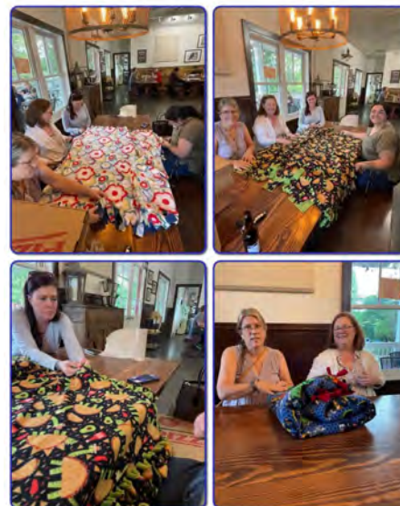
The GFWC Roswell Cares Service League had a productive April Meeting and a Meal on April 17, 2024. Thanks to 2nd VP they crafted no-sew blankets for Simple Needs Georgia, who distributes 500 blankets annually to children, people experiencing homelessness, and others in need.