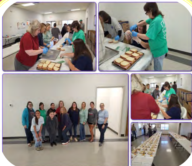
The GFWC Sylvania Junior Woman's Club helped make and pack meals for the elderly and the needy at the Screven County Soup Kitchen on Saturday, April 13, 2024.