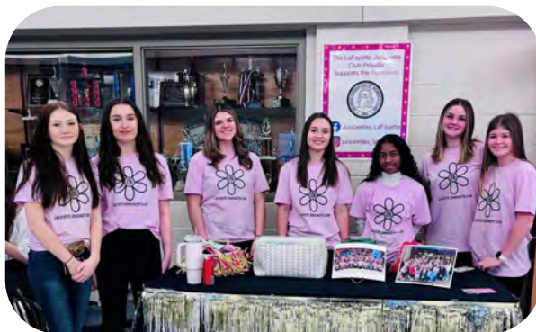
The GFWC LaFayette Juniette Club makes a difference at the Walker Games supporting their teams.