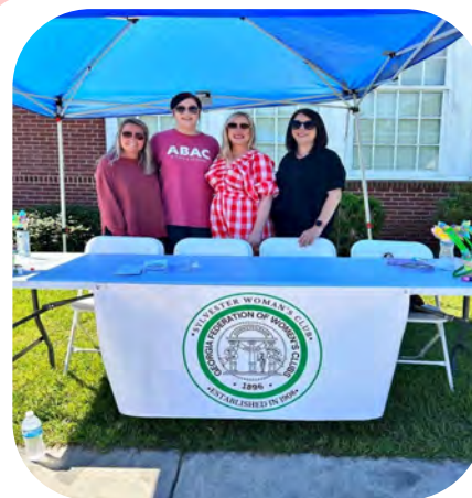
The GFWC Sylvester Woman's Club participated in the Spring Fling in Sumner selling Alzheimer's pin-ups, Morning with Mom tickets, and collecting books for the Sumner Library.