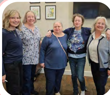
Members of the GFWC Calhoun Woman's Club sported blue to support of Child Abuse Awareness and Prevention Month.