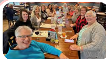
The GFWC Dawson County Woman's Club had a fun night in early April playing trivia. They led most of the night but came up short on the last question. Couldn't remember Winston Churchill! They still placed third!