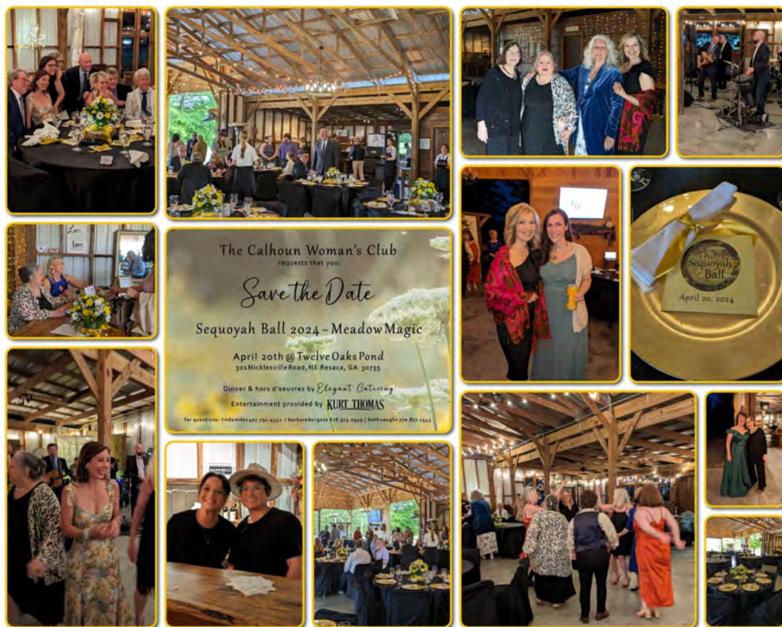
On April 20, 2024, the GFWC Calhoun Woman's Club held their 2024 Sequoyah Ball at Twelve Oaks Pond, a Weddings & Events Venue.