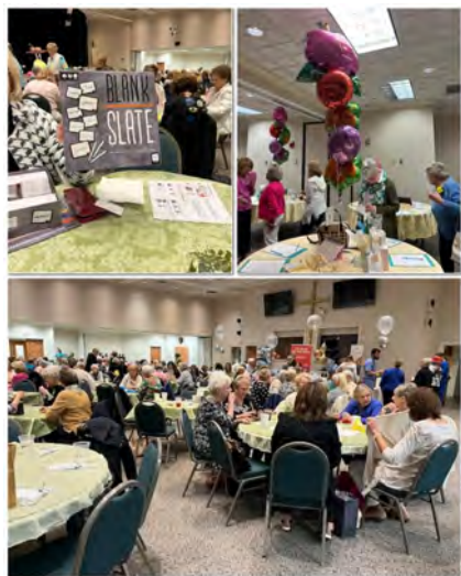
Members of the GFWC Dunwoody Woman's Club attended the Dunwoody Garden Club's annual card party and fashion show. All funds raised will be used for community projects.