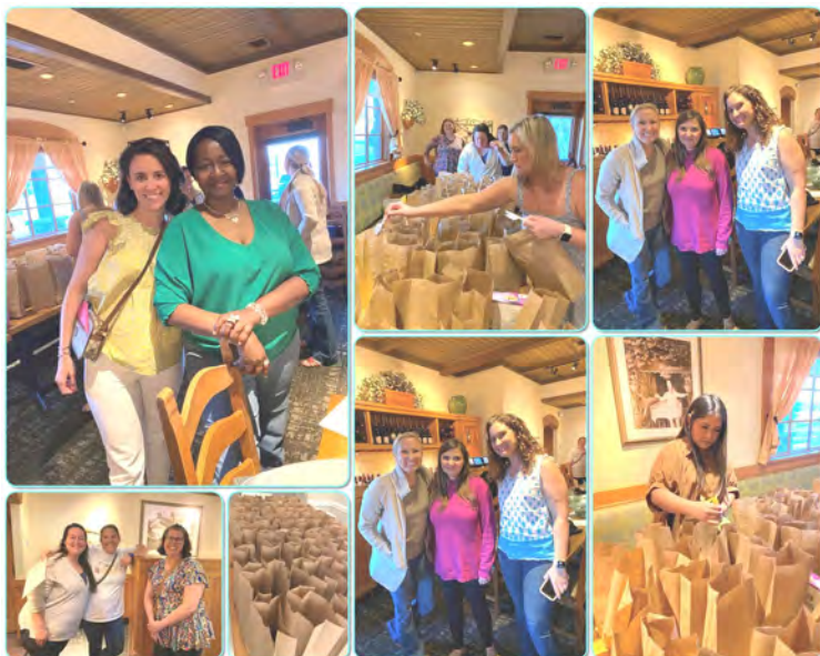
The GFWC Tifton Junior Woman's Club had a successful meeting in April preparing for several upcoming events. They were also able to stuff their soup kitchen bags.