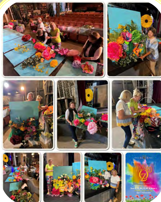
Members of the GFWC Hartwell Service League helped with stage décor for the Hart County Community Theatre's production of The Wizard of Oz , scheduled from May 17 to June 2. Members showcased their talents by making floral decorations for Munchkinland.