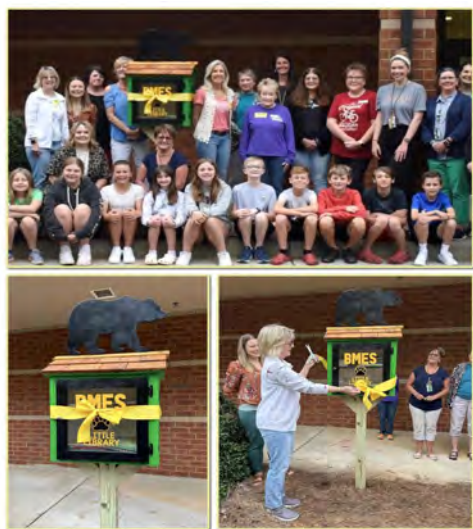
The GFWC Dawson County Woman's Club donated a Little Free Library to the Black's Mill Elementary School. The students decorated the box.