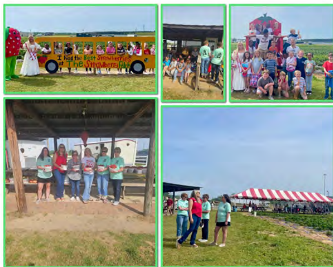
The GFWC Reynolds Woman's Club at a great time with all, especially telling stories to the children, at The Strawberry Patch at Taylor Orchards