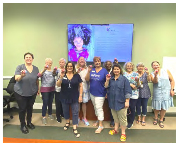
The GFWC Gainesville Phoenix Woman's Club had its April meeting at the Hall-Dawson CASA offices, and they learned about the court-appointed special advocates programs.