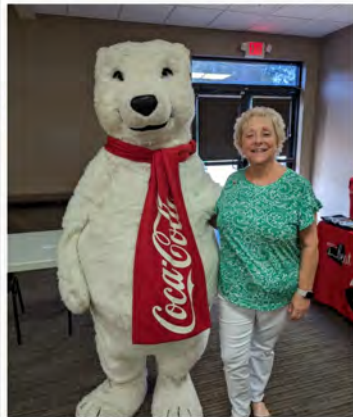
The GFWC Tifton Woman's Club handed out bags with deodorant and candy to local children at the YMCA Healthy Kids Day on April 20, 2024.