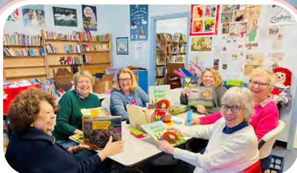
Six members of The Atlanta Woman's Club volunteered in April at Children Read. They placed stickers and bookmarks on new books donated by a publisher,