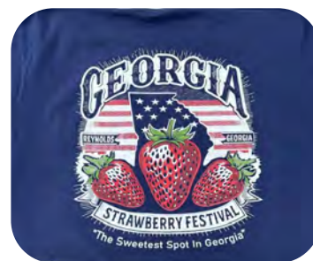
The GFWC Reynolds Woman's Club decked out in the festival t-shirt sold these fashions at the Miss GA Strawberry Festival. Proceeds from the sales will fund scholarships for high school seniors.