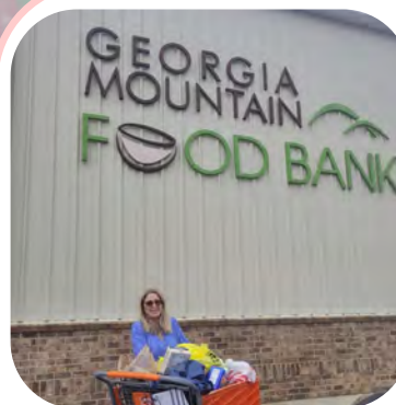
As part of their ongoing involvement with the Georgia Mountain Food Bank, the GFWC Gainesville Phoenix Woman's Club collected more than 140 pounds of food in March at the Burn Boot Camp and Stephens Point. The collection of food is part of the club's Civic Engagement and Outreach CSP.