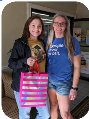
The GFWC Tifton Woman's Club made goodie bags for National Library Workers Day.