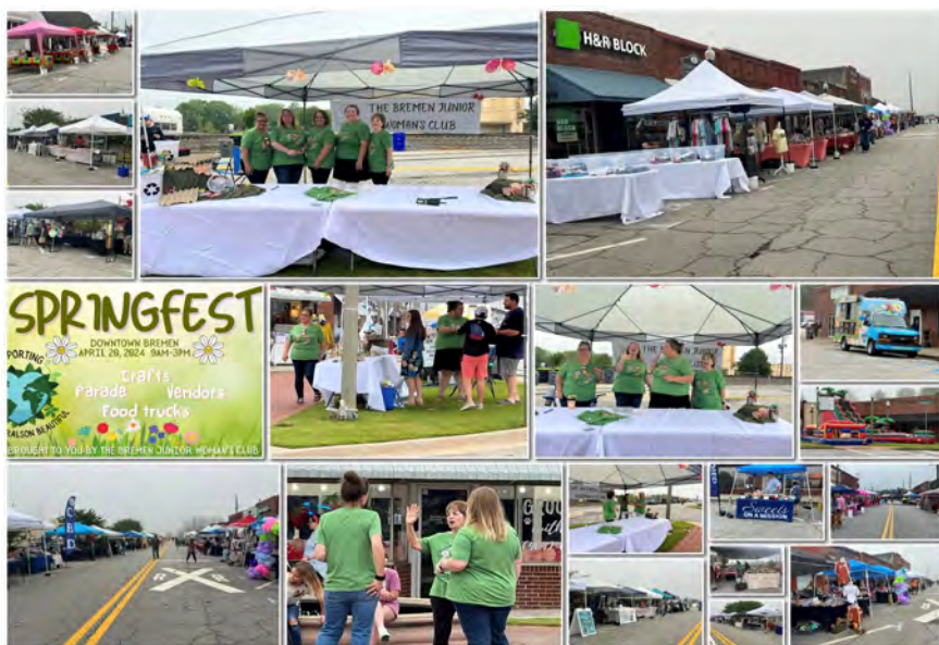
The GWC Bremen Junior Woman's Club held their Springfest on Saturday, April 20, 2024. Lots of activities and fun for the whole family!