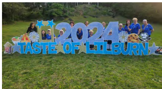
The GWC Lilburn Woman's Club had their 2nd Annual Taste of Lilburn on Saturday, April 20, 2024. It was a resounding success.