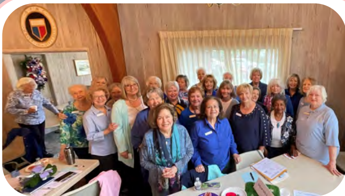
The GFWC Stone Mountain Woman's Club stood united in wearing blue in April to fight child abuse during National Child Abuse and Prevention Month.