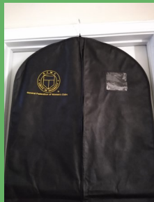
$20 Large-Log Garment bag 24"x54" black with gold GFWC logo