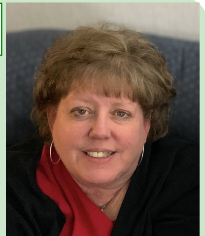
Why I Belong to GFWC Georgia

Clubs use the Next Door app to share club meeting information