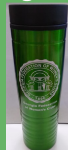
$10 6 oz Stainless steel tumbler in emer- ald green, GaFwc logo in white. plastic liner and push-on lid features a swivel mechanism to help reduce spills or leaks