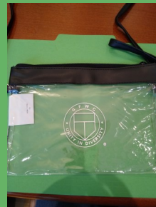
$10 Clear Wristlet Clear vinyl 6"x9" with GFWC logo in silver,