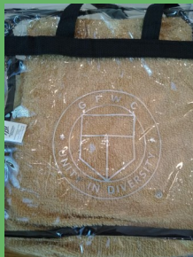
$15 Clear Tote Clear vinyl 12"x12"x6", GFWC logo in silver